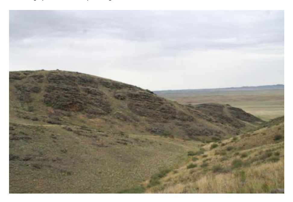
Fig. 8. General view of Sunkarsay Gorge

The new touristic route across Sunkarsay is urged to be a positive example on the basis of which further will be created tourist routes of the Tamgaly and to develop management of similar natural historical and cultural monuments in and outside Kazakhstan.