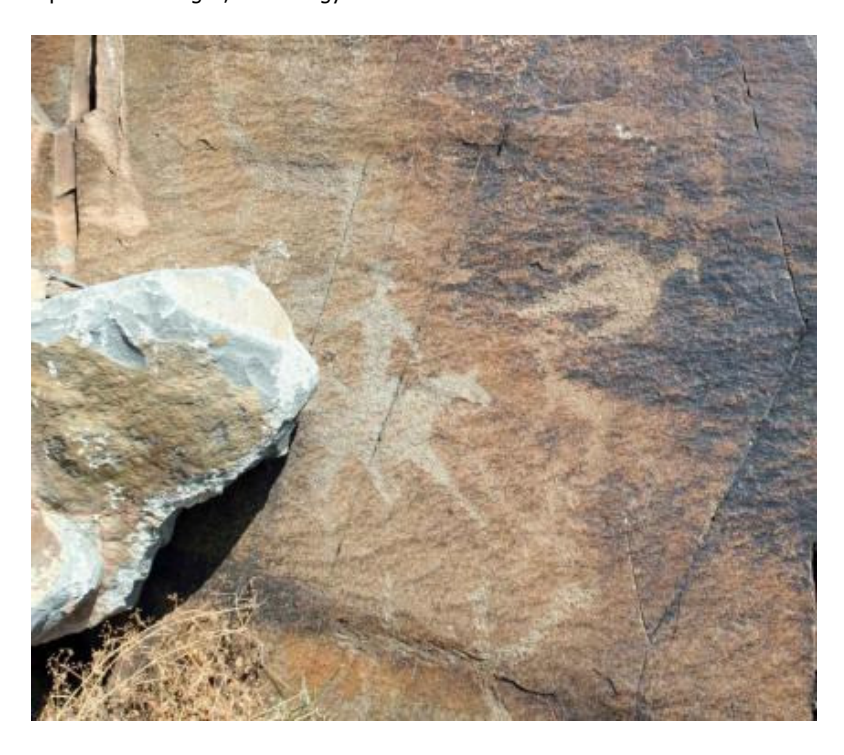
Fig. 4. The hunting scene of the horse rider with the bird. The Early Tirkic time

scenes represented on its rocks – hunting with a falcon). The main part of petroglyphs of Early Turkic Time sharply differs from rock drawings of other eras, first of all in the pronounced ideology. Alexey Nikolaevich Maryashev for the first time defined the Early Turkic layer of petroglyphs of Zhetysu exactly by petroglyphs that present in Sunkarsai Gorge characterized by the special graphic style, repertoire of images, chronology.