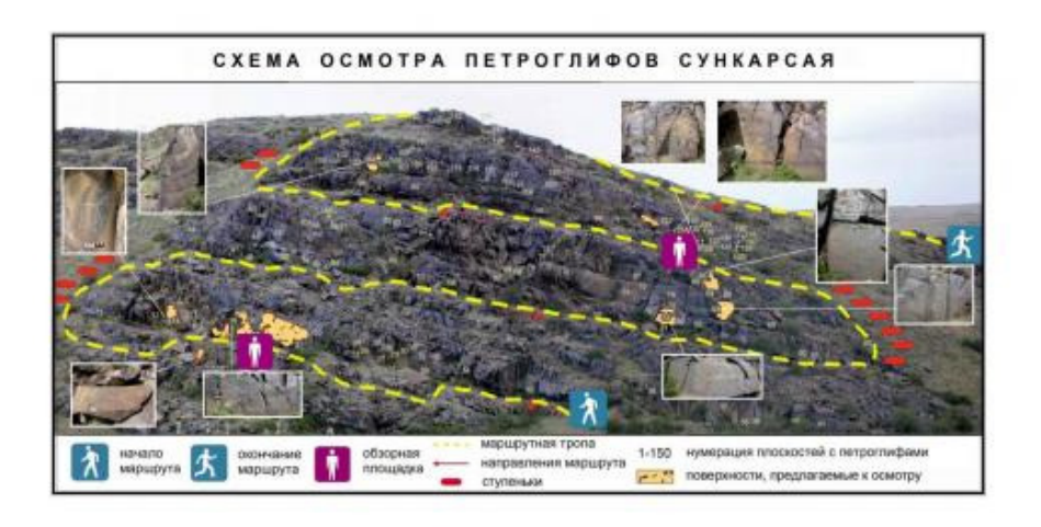
Fig. 1. The scheme of the route by petroglyphs of Sunkarsai