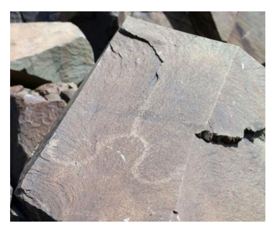
Fig.5. The carved image of sign - "tamga", belongs to the Early Turkic times

Many of known settlements of the Tamgaly are the multilayered monuments containing the cultural remains of several historical eras. There are seven burial grounds of the Bronze Age (Tamgaly I, II, IV-VII, Karakuduk II) which are grouped mainly along the main valley on the right and left river banks of Tamgaly are known in the territory of the Natural Boundary. The cult constructions (altars) are very rare and important monuments indicating preservation in traditional culture up to the beginning of the XX century of the sacral importance of places with petroglyphs.