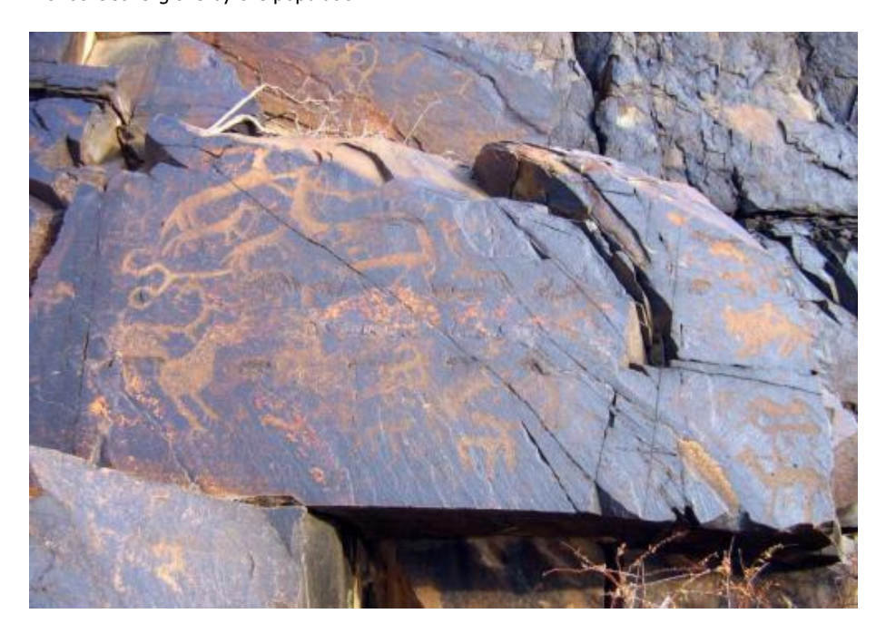
Fig. 2. Carving images of aninals, Bronze Age, the sign- tamga Early Turkic time

its development stops (is sharply slowed down) in the societies getting a state system, with giving of religion of the official status, with construction of temples, by architectural canons, issued by religious painting. Especially this process amplified with adoption of monotheist religions by the population.