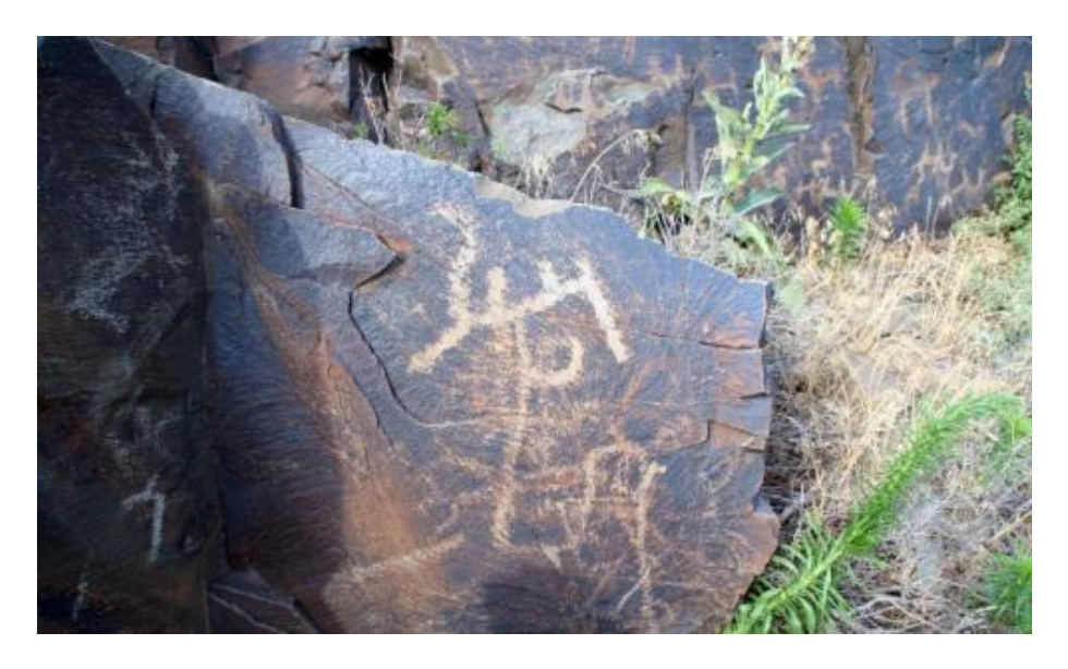
Рис. 6. The image of the tamga, sign of the Early Turkic Epoch

Therefore the highlights demanding attention when carrying out future excursion it is unconditional continuity of habituating of the Natural Boundary of the Tamgaly and allocation of cult character of its center. As confirmation of that the prayful inscription can serve, most likely, of the Manichean person that belongs to the IX-X centuries, and also the image of the radiant beam deity on group of petroglyphs V. The appeal to similar things, arrangement of additional emphases on them will allow to strengthen of the "Early Turkic component" when carrying out excursion on the central natural boundary, to connect it with a new route which will become logical continuation of the first.