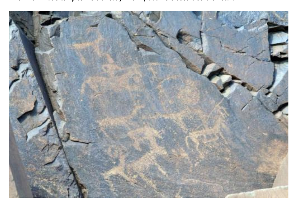
Fig. 3. The image of the horse riders with banners, the Early Turkic time

However completely the tradition of rock art in Central Asia doesn't die till now. Here everywhere, including in the Tamgaly, the separate images dated with the Late Middle Ages up to the XX century are meet. It characterizes continuation of tradition of creation of rock carvings at the population living in an environment of ancient petroglyphs and wishing to leave and the trace in this series of certificates of time; outlook of the artists who left similar images were related to artists, left the main image subjects of the Tamgaly. Including, the new route will reflect also these noticeable differences between a large sanctuary of the Bronze Age on which the main route is laid, and to one of congestions of petroglyphs of the periphery of the Tamgaly where there are some subjects and signs of the Early Turkic time when man-made temples were already known, but were used also the natural.