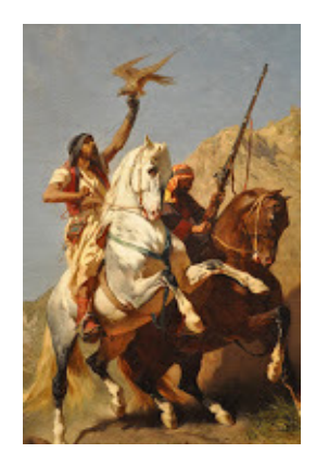
Arab hunters - oil on canvas - Alberto Pasini, Italy - 1865