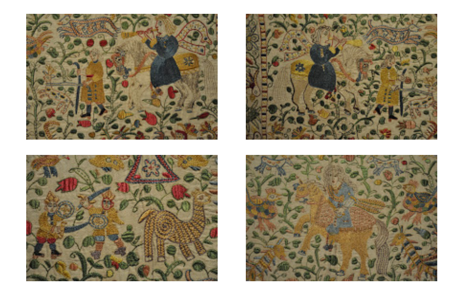
Quilt whose central theme is hunting - embroidered linen taffeta with polychrome silk thread - India (?) - 17th and 18th centuries.

Falconry across Arab countries, Uzbekisthan, Kyrgysthan, Japan, Taiwan, Pakistan and Portugal.