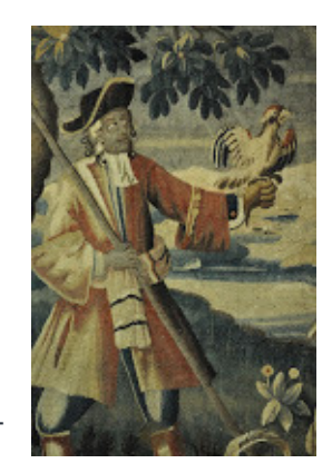
Falconer and his assistant with two dogs woolen tapestry - France (?) - 18th century.