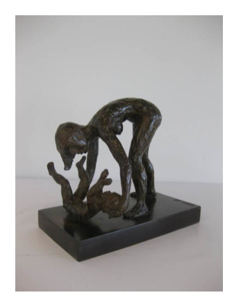
BATHERS MODEL 2002 - 8" X 5" X 9"