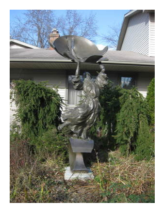
SAINT FRANCIS 1989 - 9 FEET