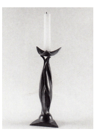
PASCHAL FLAME MODEL 1993 - 8"