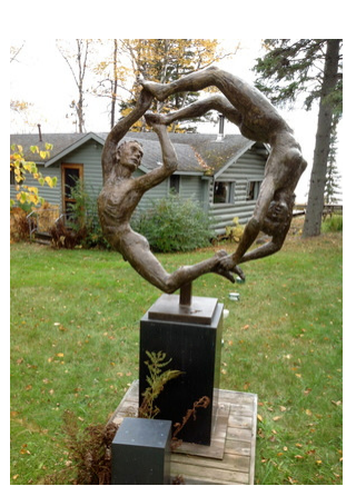
orbit III 1999 - 4' 7"