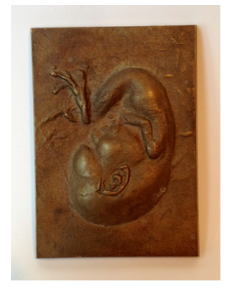
FETUS RELIEF (PEWTER) 1954 - 5" X 4" X 1"