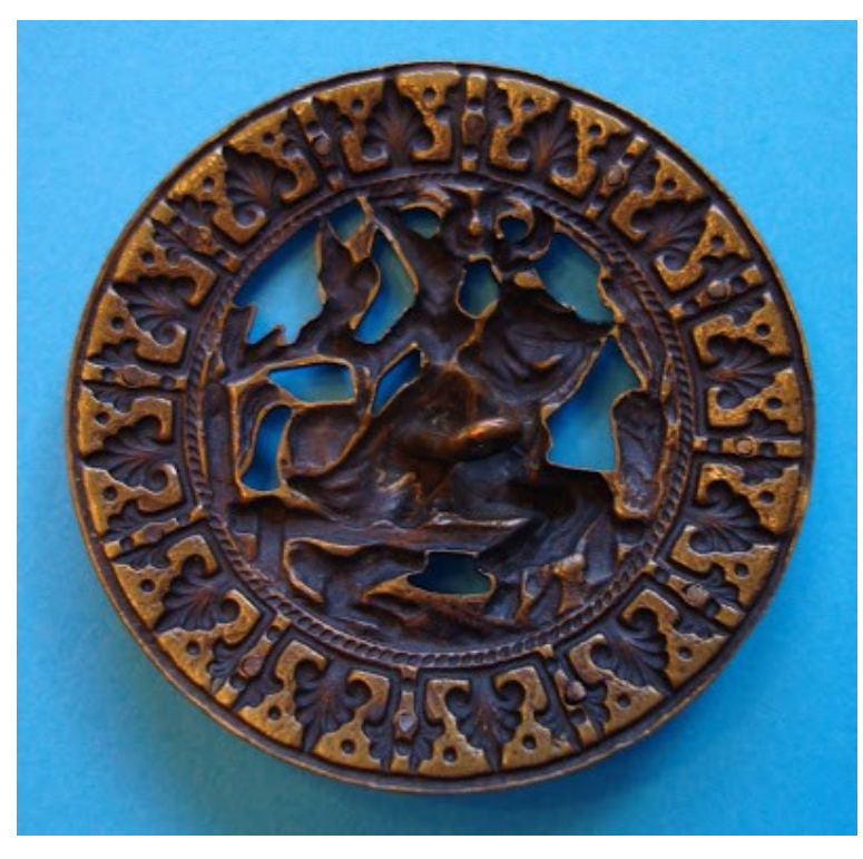
Falcon Huntress - Back

c1880s One Piece Stamped and Pierced Brass Riveted Cut Steels Fancy Border NBS Large, 1 5/8"