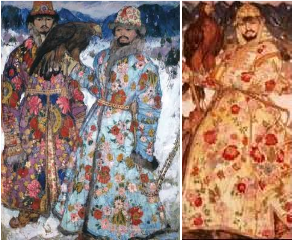
Left. Falconry in Central Asia. 1936. From web-site: https://app.cuseum.com/art/leon-gaspard-falconry-in-central-asia-1936