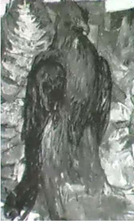
The king of skies. Oil, canvas, board. 46 x 38 cm. (18.1 x 15 inches). From web-site: http://www.artnet.com/artists/leon-schulman-gaspard/king-of-the-skies-PqQmtvP-HgwEztgehH9nwg2