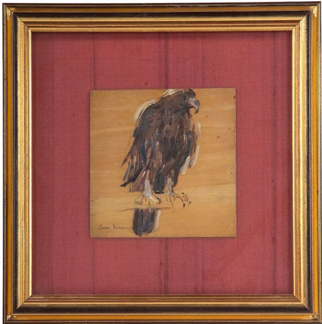
Falcon (in reality this is hard identifying representative of Accipitridae family). 7 x 7 inch (17.78 x 17.78 cm), in frame.