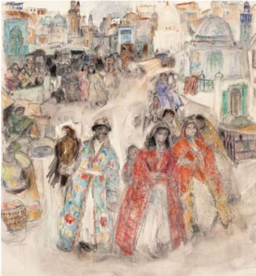
Festival of eagles. Mixed colours, board. 50.75 x 47.76 inches (128.9 x 121.3 cm). From website: http://www.artnet.com/artists/leon-schulman-gaspard/festival-of-the-eagles-M56JzQNX5kfGUvwWJgXHw2