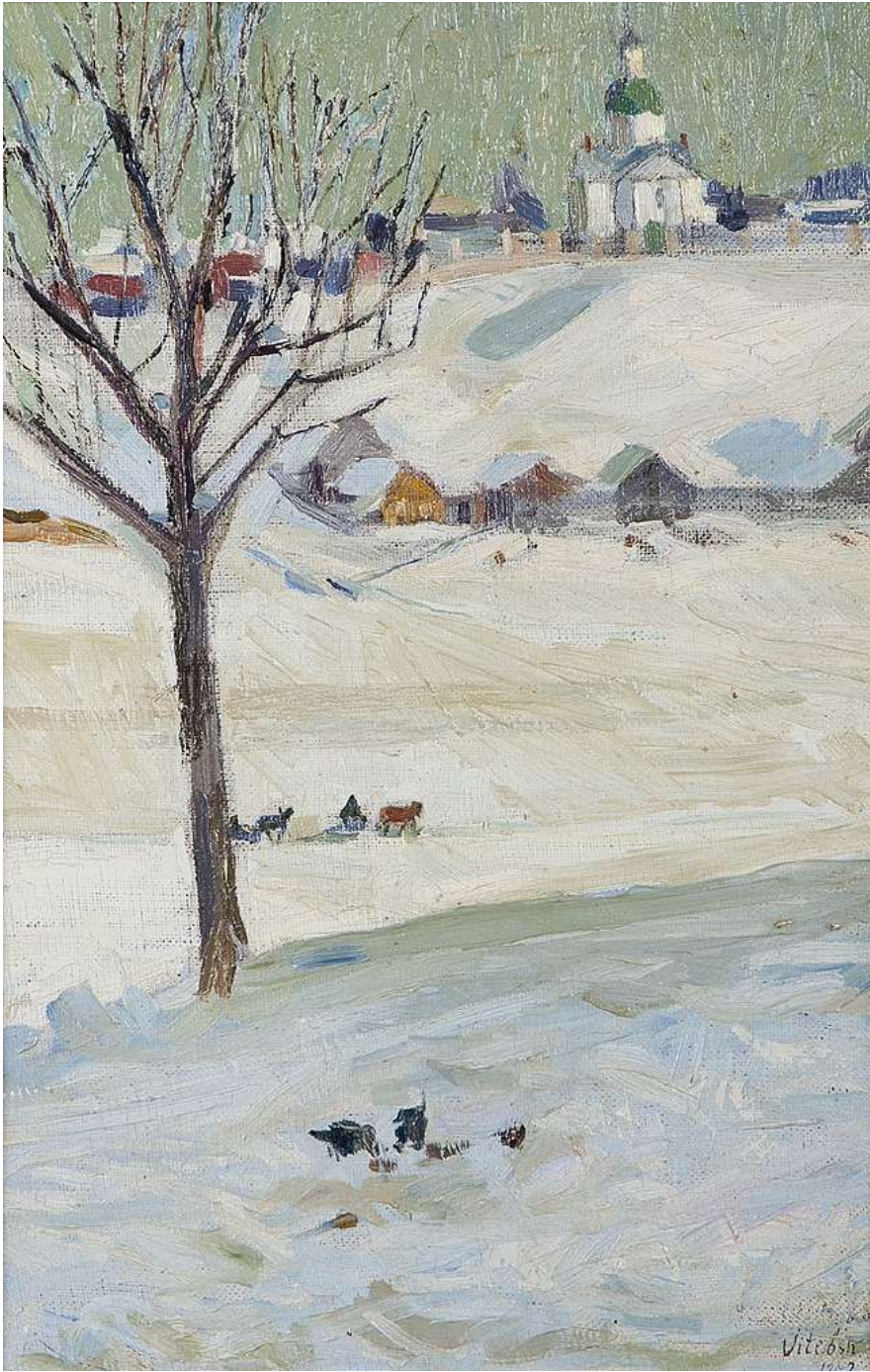
Winter visitors.