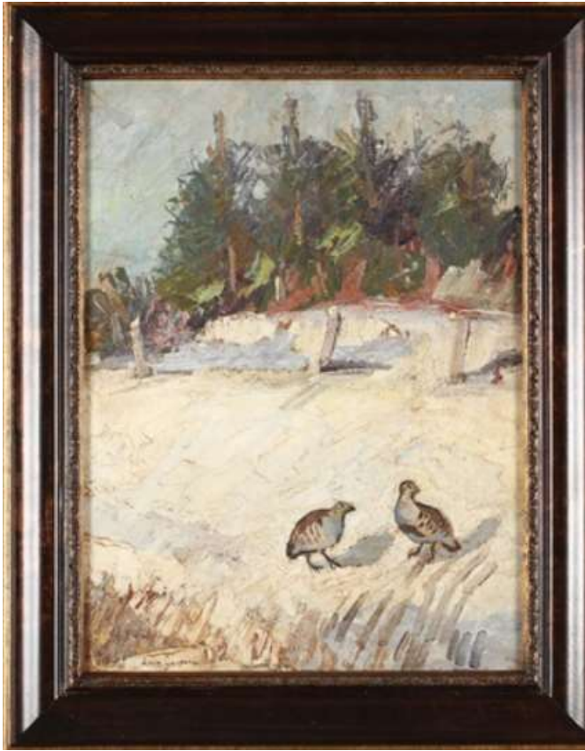
Partridges on snow. Oil on board. 15.5 x 11.5 inch (39.4 x 29.2 cm.). From web-site: http://www.artnet.com/artists/leon-schulman-gaspard/partridges-in-the-snow-2rUAUgaMIGNTJf8GxIg7Q2