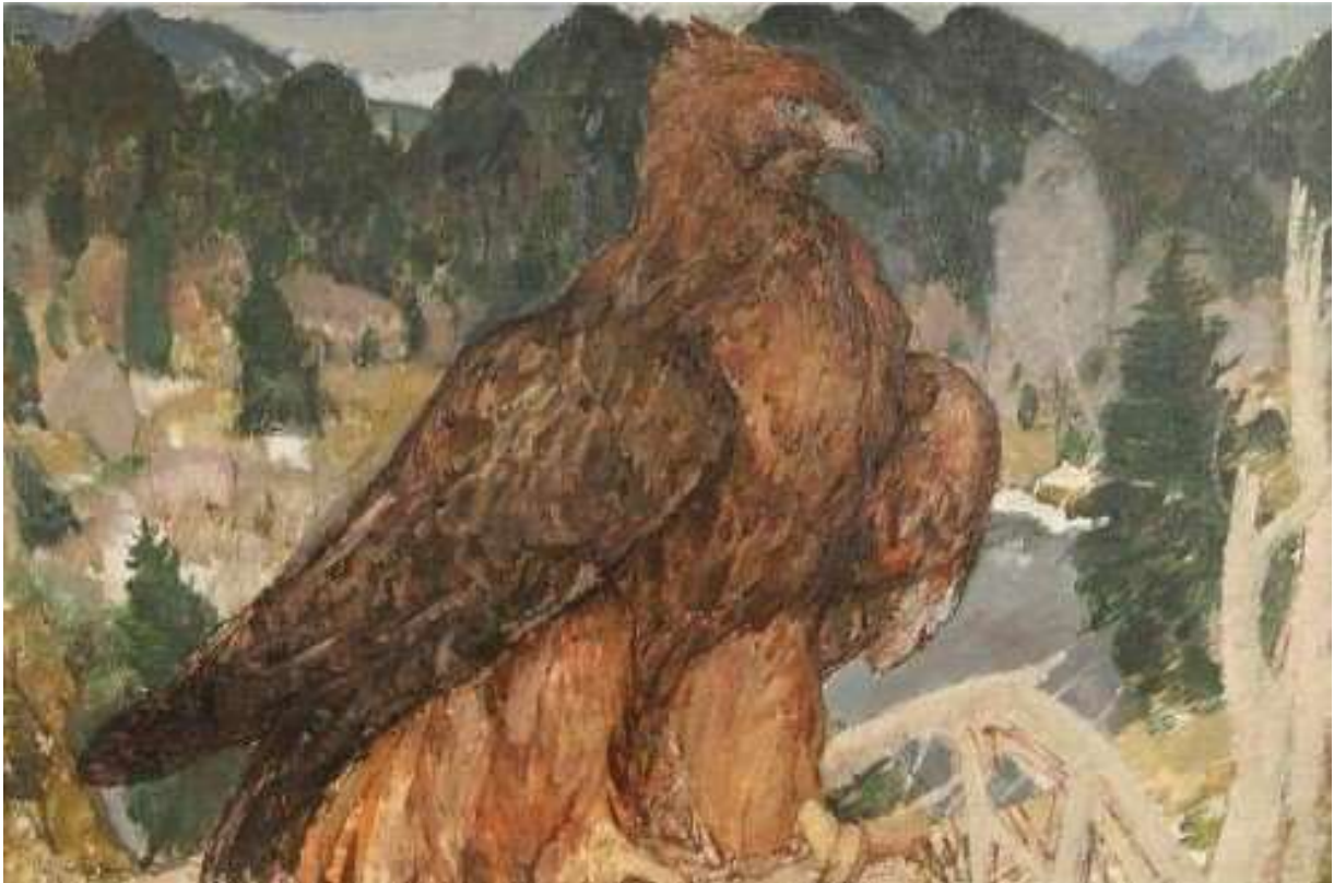
Eagle on perch. Canvas, oil. 20 x 29 7/8 inch (50 x 76 cm). The Tobin Foundation for Theatre Arts. From web-site: https://doyle.com/auctions/03pt02-modern-contemporary-and-european-american-paintings/catalogue/251-leon-schulman