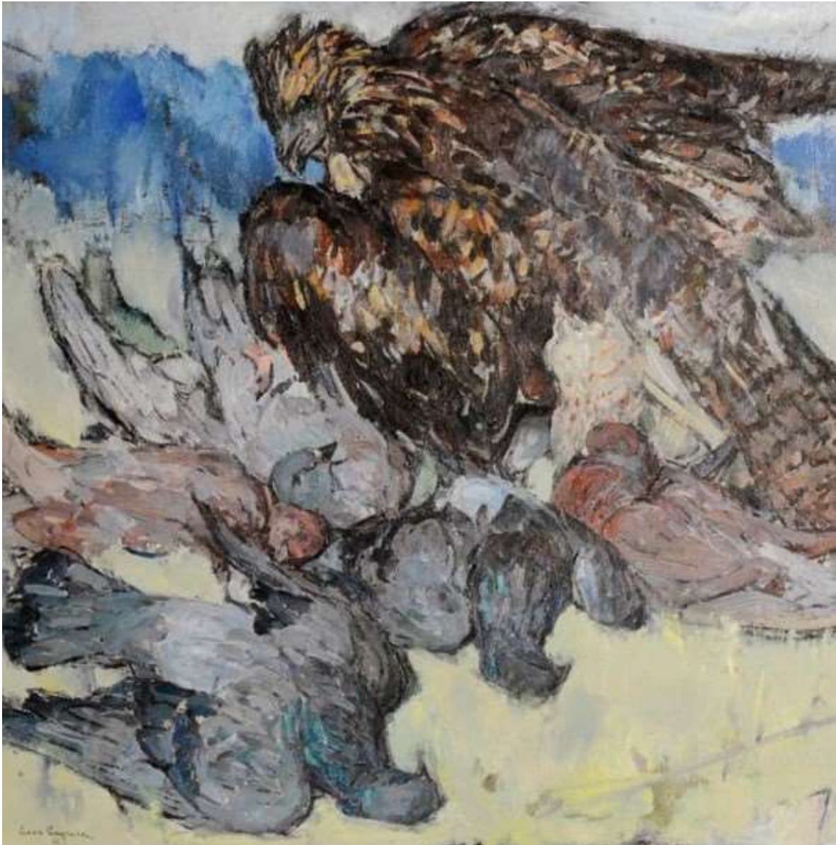
An eagle and pigeons. 23 3/4 x 24 inch (58.42 x 60.96 cm). Provenance: Kennedy Galleries, Inc., New York, New York Maxwell Galleries, San Francisco, California, Fenn Galleries, Ltd., Santa Fe, New Mexico Santa Fe East Gallery, New Mexico, private collection, New Mexico.