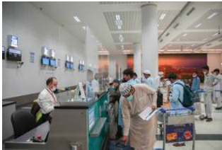
Abu Dhabi International Airport reopens Terminal 2