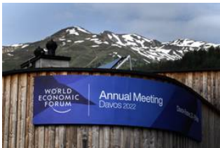
Rare spring meeting in Davos in search of solutions for major challenges