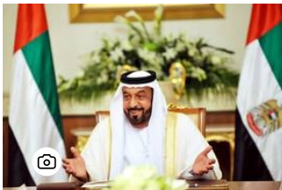
Sheikh Khalifa tributes reflect 'beloved leader', says Sheikh Mohamed