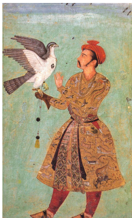
Emperor Akbar - Los Angeles County Museum of Art. 'Royal figure with falcon' by an unknown artist. The painting dates between 1600 and 1605.

► Researchers at New York University Abu Dhabi are compiling a database of falconry imagery through history