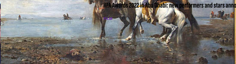
IIFA Awards 2022 in Abu Dhabi: new performers and stars announced FILM