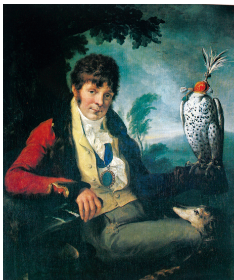
Oil painting of Thornton by Philip Reinagle