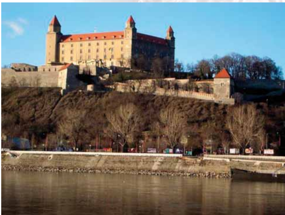
The castle upon the river Danube – Slovak capital Bratislava was nice to visit