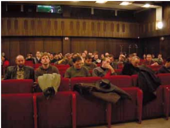
Seminar hall in the hotel Druzba