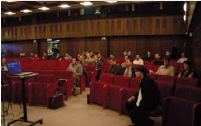
Slovak, Czech, Hungarian, German, Polish and UK representatives were present