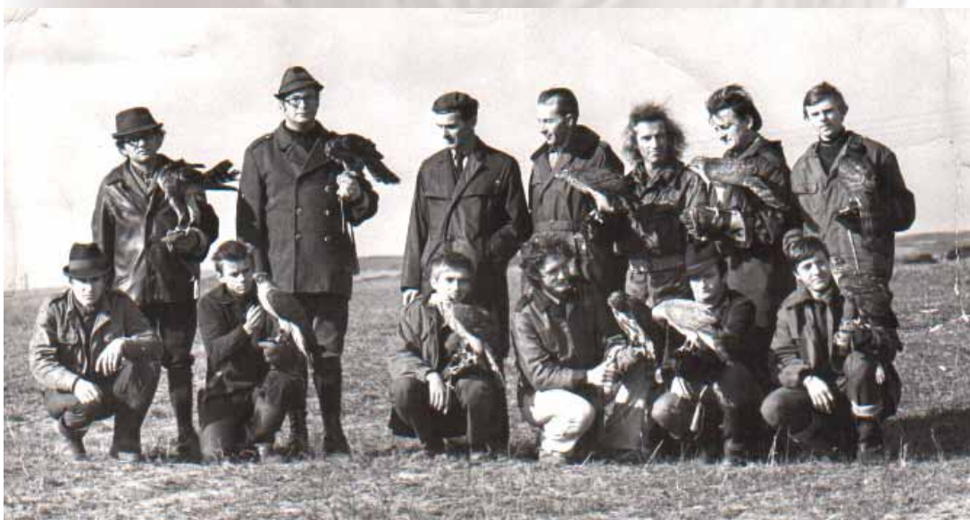
First polish falconers (1972)

Now falconry in Poland is practised by ca. 150 falconers, mainly members of Polish Falconry Club "Gniazdo Sokolników" and Polish Falconry Order - second club established in 2001. Legal status of falconry much improved over the years, being now included in Hunting Law. Falconry now is also environment education, raptor protection and cultural heritage protection. Falconers play a main role in Polish Peregrine Restitution Project, with more than 300 Peregrines released and wild breeding population started in 1998.