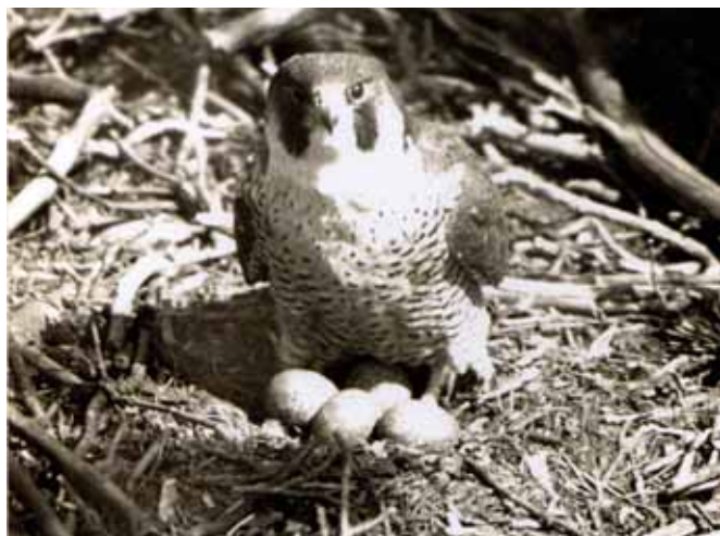
female peregrine with eggs on a former eagle's nest

Like many other countries, Germany looks back at a long history in falconry. The period from 500 to 1600 saw the zenith of falconry in Germany. Particularly notable past German falconers include Emperor Friedrich II, and the fanatical eighteenth-century falconer Margrave Karl Wilhelm Friedrich von Brandenburg-Ansbach. However, there was a decline in the popularity of the sport in the 19 th century, until some dedicated people founded the "Deutscher Falkenorden" (DFO) in 1923. With more than 1300 members it is now the biggest German falconry club and it is the oldest existing falconry association in the world.