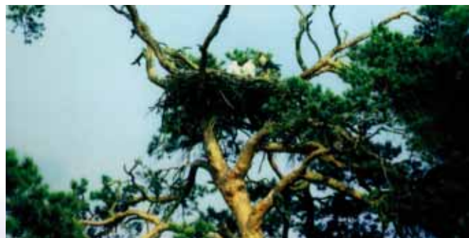
(Success for the project - Tree nesting Peregrine of the newly introduced generation feeding young on a former Osprey's nest)

As a result, the DFO has been officially acknowledged as a nature conservation society by German law (§ 59 BNatSchG).