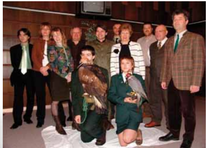
Dr. Irena Belohorska, member of EU parliament, between falconers