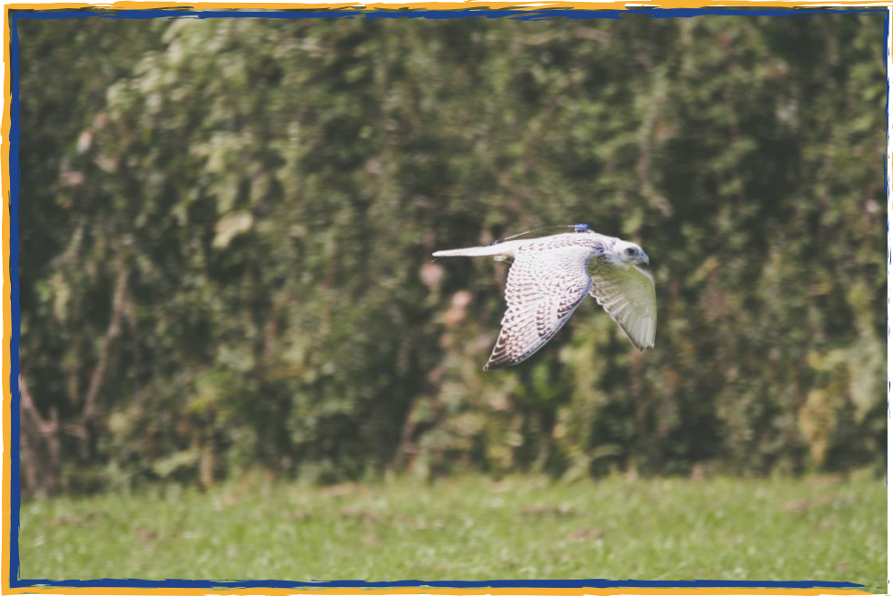
Mauri, a white Gyr Fox Falcon competing in the Telwah Race at Vowley 2019.