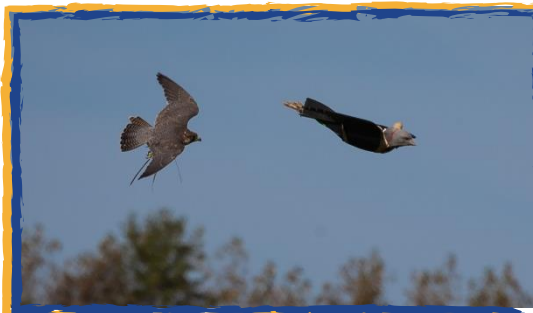
Falcon pursuing a Wingbeat Rocrow at Vowley.