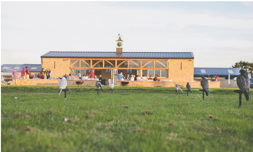
Falcons on the pavilion weathering lawn

We have developed Vowley on a 110-acre site specifically for falcon training and racing. It is managed by Charlie Hewitt-Dean and his partner Karen and has accommodation for visiting staff and falconers with a capacity of up to 90 falcons in training at any one time. We have a professional full length 400 metre Telwah course for Flat Racing with laser timing accurate to 1/1000s of a second. We also have two further training courses for the Telwah. Our course for Hunt Racing is 400 x 400 metres, again with additional training fields.