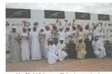
Abu Dhabi Falconers Club winners at prize ceremony

With so much emphasis and attention given to these races it is inevitable that they have become a national sports event much like soccer or football elsewhere. Live TV coverage of the falcon races play during race competitions and cameras and media coverage are always present on a race day. Some of the state of the art TV video cameras are used with slow motion footage showing every wingbeat and manoeuvre of the falcon. It's easy to get caught up in the hype and now some competitors are like sports personalities.