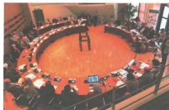
IAF AGM in the Valkenswaard Town Council Chambers, Netherlands 2013