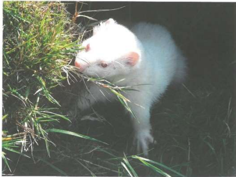
There are no more rabbits down here, Boss