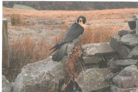
Snipe hunt