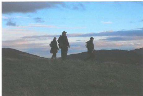
Hawking in a Scottish landscape