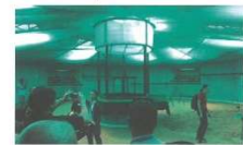
A moulting aviary

Abu Dhabi Falcon Hospital has an international reputation for raptor medicine. Although it is not really geared to take visitor groups of multiple coach loads, the impressive nature of the hospital facilities and professionalism of the staff was clear. During a relatively short presentation in the falcon waiting room (handlers have a separate waiting room), two of the waiting birds muted. The mutes were immediately mopped up and the floor disinfected by what appeared to be a member of staff dedicated to that purpose. Money is clearly no object to the Emirati falcon owners: some have their birds hitched on a weekly basis and they make use of special moulting aviaries at the hospital where birds, after undergoing checks, are housed for the full six months on a daily diet of a whole quail each.