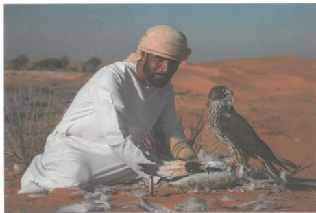
Houbara hunting