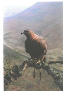
Properly jessed eagle, 'Maria'

These days all raptors that are flown seem to be fitted with aylmeri anklets but sadly far too many people seem to be so lazy or just plain stupid and fail to change from mewes to slit-less flying jesses (or no jesses) when flying their hawk.