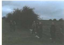
NW Region longwing group meet

We have had a fair few field meetings on Llandegla and Bryn a Pys and we will be booking more for the season coming.