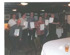
Region Members receiving Lantra Certificates