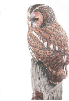
The Tawny Owl carving

When I am happy with the sculpture, which due to my critical eye or annoying compulsive behaviour, as my wife calls it, I call it finished. The pieces are divided into those which are to be used for limited edition runs and they are at this point used to create moulds, for either hot or cold bronze casting. The moulds are then used typically for a run of fifty sculptures before being destroyed. The original piece is then hand painted using acrylic colours, those large one off pieces which are not cast, do of course just skip straight to the painting stage, which just like the carving process can take many weeks. The Tawny Owl which recently won reserve champion in the British Bird Art championships took a month and a half to paint and I could have cheerfully throttled every tawny in the country by the time I finished it.