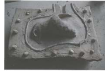
Mould for lanner casting

For the carvings I tend to favour a wood called Jelutong which originates in Malaysia and because of its high density is ideal for carving with both knives and machine tools. The pattern is cut on a band saw and then it's down to trying to create a life like sculpture from the resulting block with various knives, chisels and power tools. This stage of the process can take from three weeks to many months, depending on the size and complexity of the sculpture and how long I spend in hospital getting my fingers stitched back together. When I tell buyers that there is a piece of me in every bird I'm usually not kidding. Each individual feather is first carved and then textured with a small diamond stone and a pyrography pen, some feathers having hundreds of lines per inch.