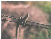
Slit jess caught on barbed wire

I have rescued or had falcons handed to me by country folk who have rescued them with more junk hanging from their legs, which would not be out of place securing a bull dog.