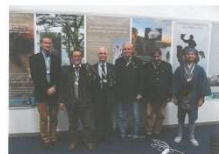
IAF and CIC meeting in 2014 during the Convention on Biological Diversity in Korea

There are a further 5 nations who have been granted "observer" status as their falconry organizations are not ready for full membership. There are yet more nations with whom we are in contact and who may join our organization in time. We estimate that we currently represent about 40,000 falconers from around the world and estimates show that there may be a further 40,000 falconers in China with whom we are in early contact.