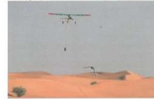
Falcon chasing lure behind plane

say these birds are incredibly fit and the top birds have incredible athletic stamina and fitness. Similar training methods are used for hunting birds also.