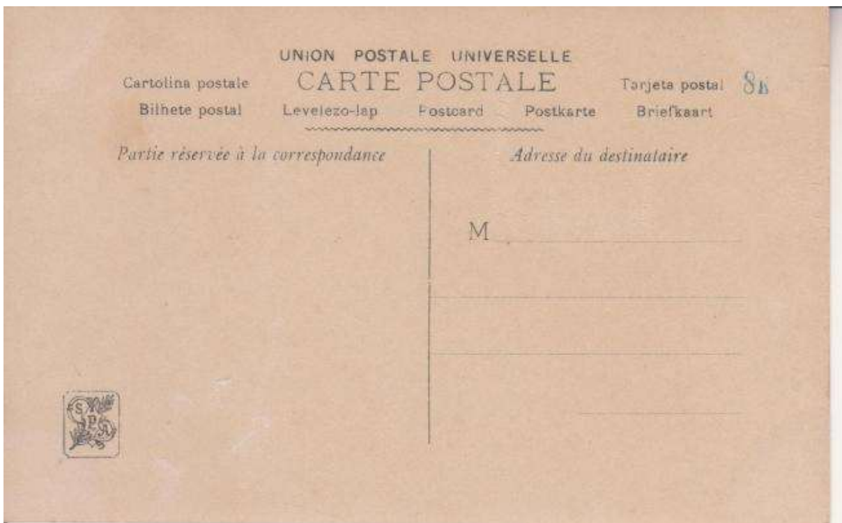
Salon de 1909 - Le retour des fauconniers par Henri Rousseau (1875-1933) Poste Carte – Postcard.

https://falconryheritage.org/Salon-de-1909-Le-retour-des-fauconniers-par-Henri-Rousseau-18441910-Poste-Carte