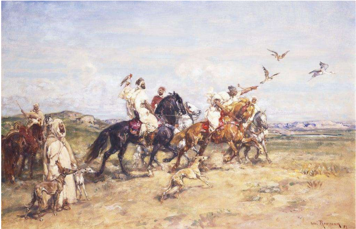
The Falcon Chase; La Chasse au Falcon, 1923

https://falconryheritage.org/The-Falcon-Chase-La-Chasse-au-Falcon-1923