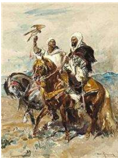
The Falconers by Henry Emilien Rousseau (1875-1933)

https://falconryheritage.org/The-Falconer-with-red-saddle-1927-by-Henri-Emilien-Rousseau-French-18751933