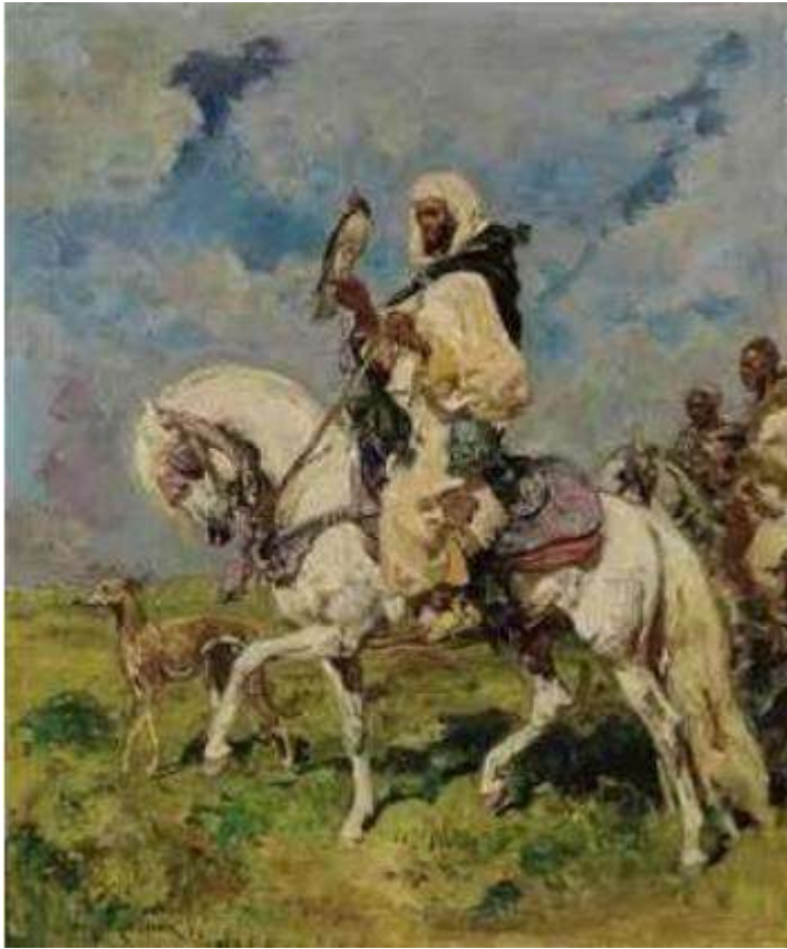
Moroccan falconer of the plains, 1929 by Henri Emilien Rousseau (French, 1875–1933)

https://falconryheritage.org/Moroccan-falconer-of-the-plains-1929-by-Henri-Emilien-Rousseau-French-18751933