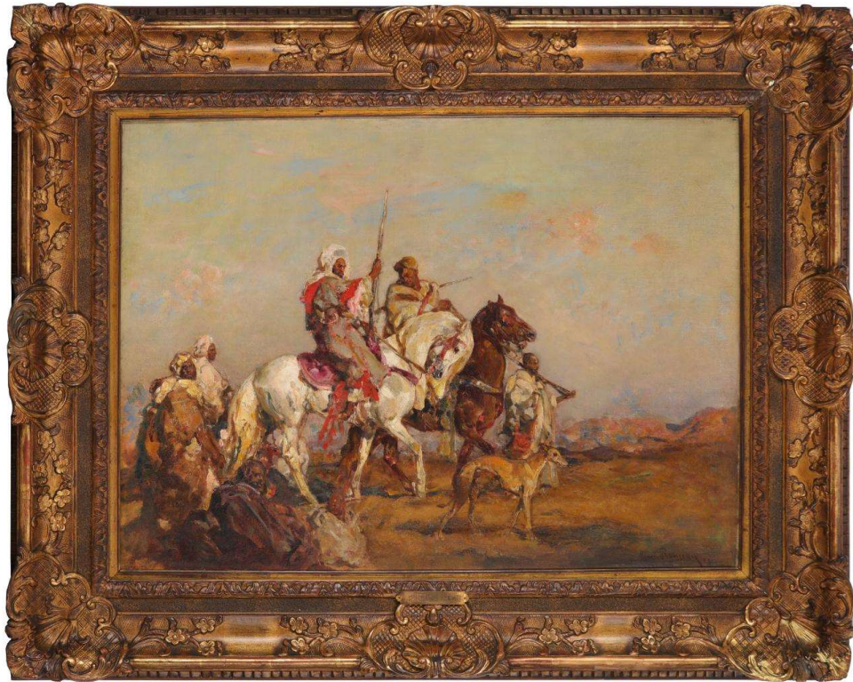
The hawking party by HENRI ROUSSEAU (FRENCH 1875 - 1933)

https://falconryheritage.org/The-hawking-party-by-HENRI-ROUSSEAU-FRENCH-1875-1933