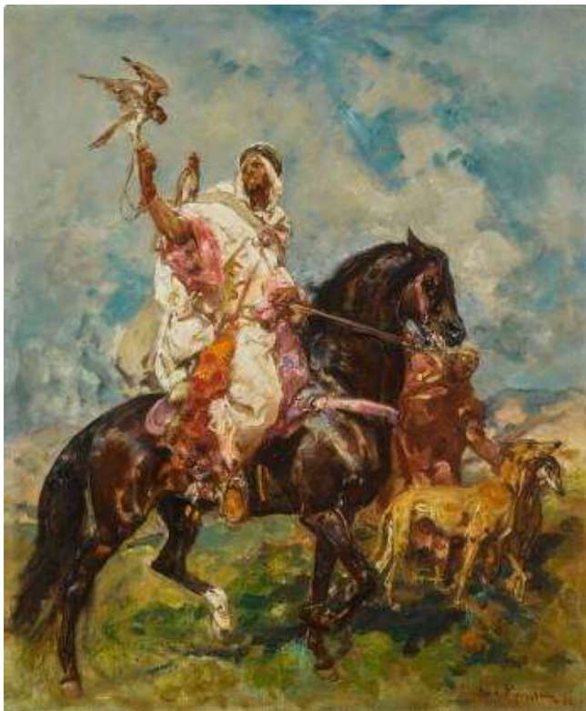
The Falconer by Henri Rousseau (1875-1933)

https://falconryheritage.org/The-Falcon-Chase-La-Chasse-au-Falcon-1923