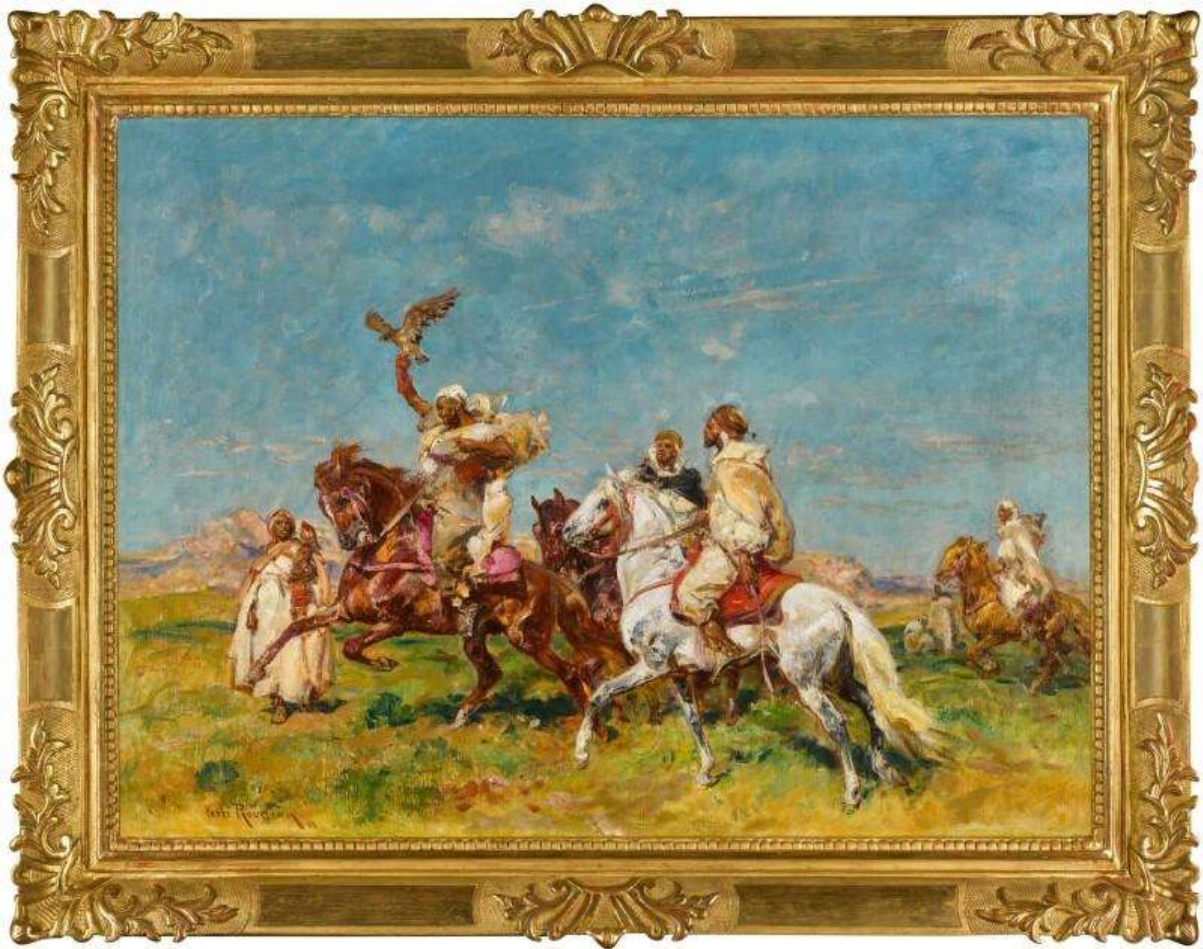
The Falconers by French artist Henri Rousseau (1875 - 1933)

https://falconryheritage.org/The-Falconers-by-French-artist-Henri-Rousseau-1844-1910