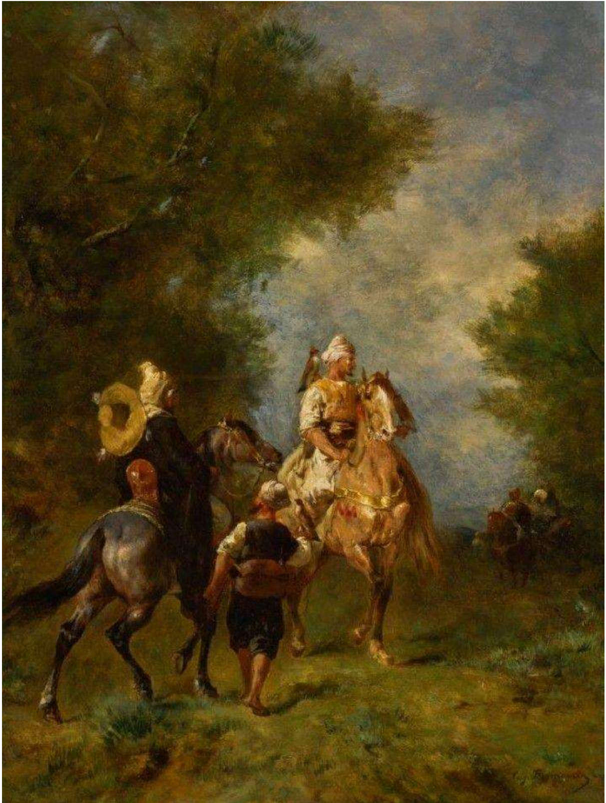
A Hawking Party by Eugène Fromentin (1820-1876)

https://falconryheritage.org/A-Hawking-Party-by-Eugne-Fromentin-18201876