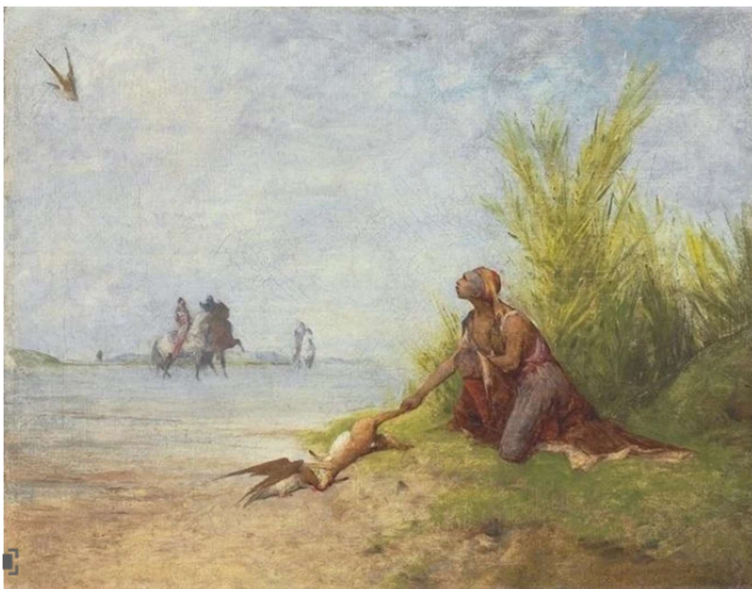
Falconers by Eugene Fromentin (1820-1876)

https://falconryheritage.org/Antique-PrintHUNTDESERTARABHORSEFALCONRYFromentinDidierca-1880