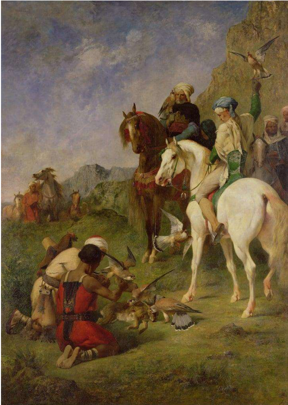
A Falcon Hunt in Algeria: The Quarry, before 1863 by Eugene Fromentin

https://falconryheritage.org/A-Falcon-Hunt-in-Algeria-The-Quarry-before-1863-by-Eugene-Fromentin