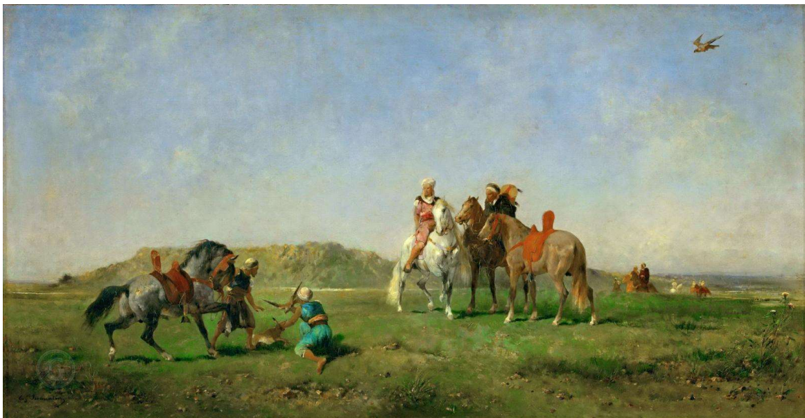
Falconry in Algeria by Eugene Fromentin (1820-1876) made in 1862

https://falconryheritage.org/Falconry-in-Algeria-2-by-Eugene-Fromentin-October-24-1820-August-27-1876