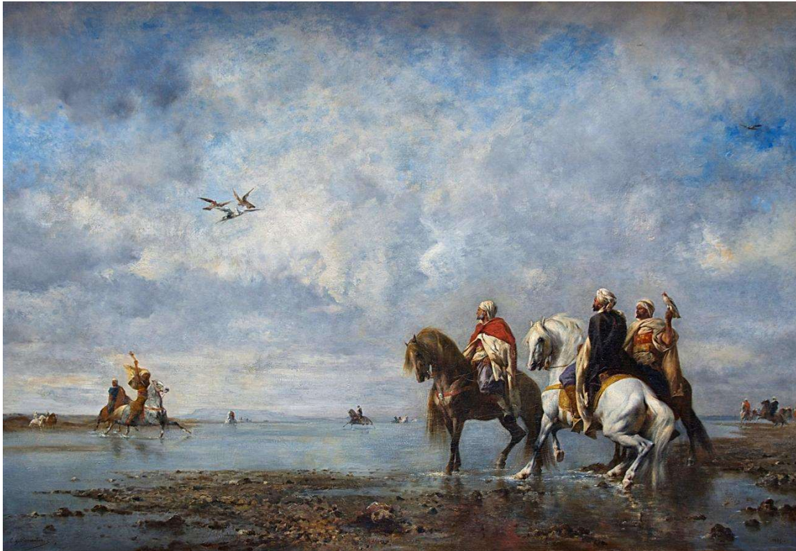
Falconry in Algeria 2 by Eugene Fromentin (October 24, 1820 - August 27, 1876)

https://falconryheritage.org/Falconry-in-Algeria-2-by-Eugene-Fromentin-October-24-1820-August-27-1876