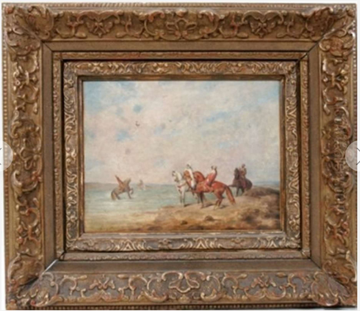
Men On Horseback Falcon Hunting by Eugene Fromentin (1820-1876)

https://falconryheritage.org/Men-On-Horseback-Falcon-Hunting-by-Eugene-Fromentin-18201876