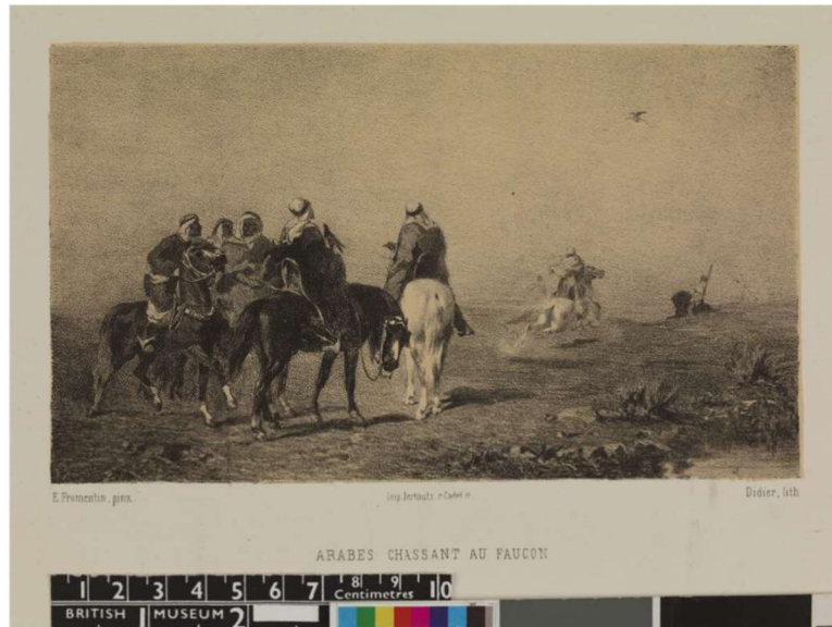
Antique Print. HUNT, DESERT, ARAB, HORSE, FALCONRY. Fromentin Didier. ca. 1880

https://falconryheritage.org/Antique-PrintHUNTDESERTARABHORSEFALCONRYFromentinDidierca-1880