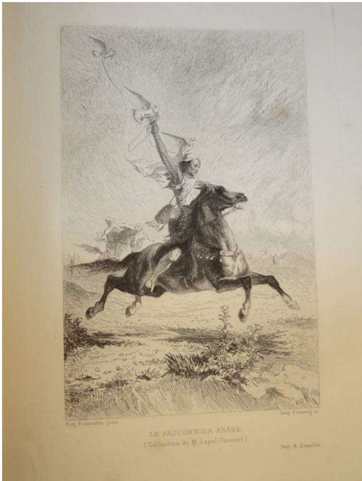
Falconry in Algeria by Eugene Fromentin (October 24, 1820 - August 27, 1876)

https://falconryheritage.org/Falconry-in-Algeria-by-Eugene-Fromentin-October-24-1820-August-27-1876