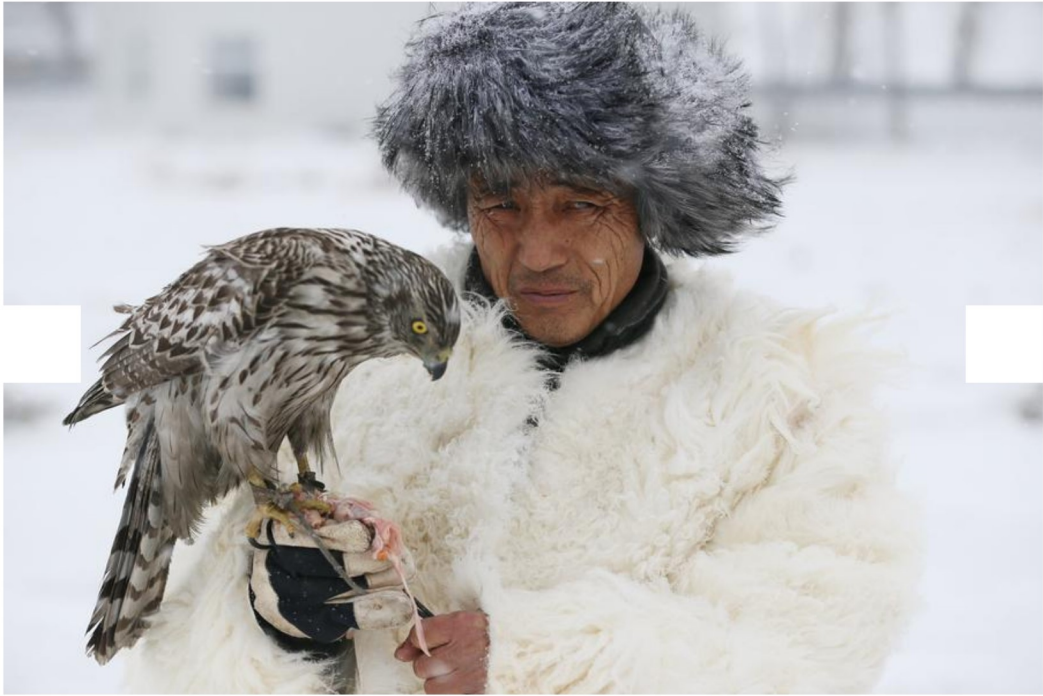
During a local tourism festival, a hunter feeds his goshawk in Jilin city of Notheast China's Jilin province, Dec 22, 2016. Hunting with eagles is a traditional form of falconry among local ethnic groups.