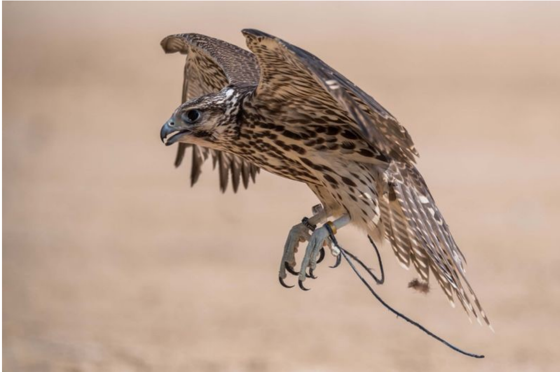
Obeid's falcon hones in on its prey

Falconry, known locally as Al Qanas (hunting in English) originated in the Arabian Peninsula around 4,000 years ago as a tool for hunting food. People would capture falcons passing across the Arabian Peninsula at the start of winter and tame the birds and turn them into highly-skilled predators. Falcons (called Shaheen in Arabic) are considered as the fastest birds in the world that can dive up to 320 kms per hour to hunt their prey. Nowadays, the birds are no longer used for hunting but falconry has been preserved as a heritage sport. Competitions are broadly separated into Farkh (for falcons under one year of age) and Jirnas (over one year), and each category has races for the Saqr (male) and Shaheen (female)