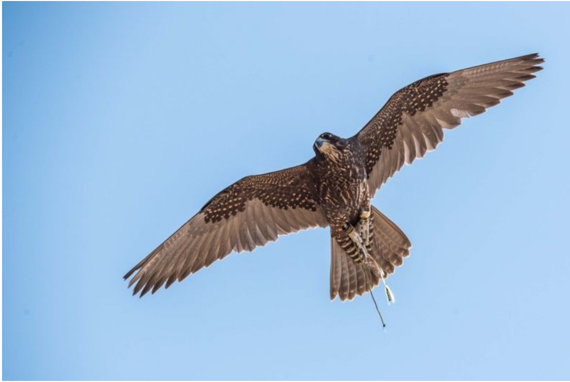
Obeid's falcon in flight during a recent competition