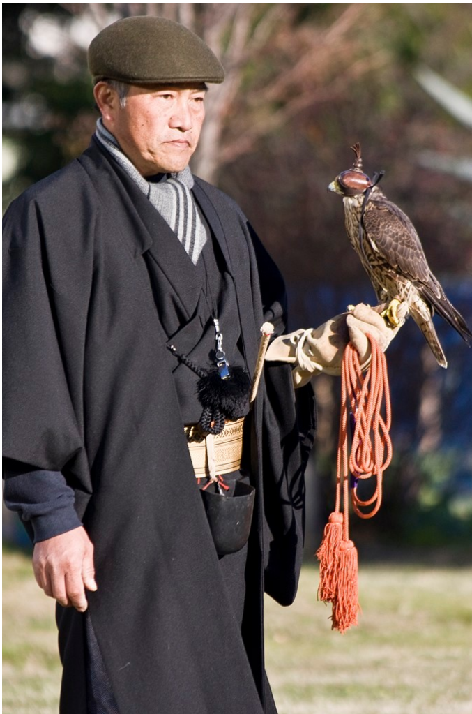
Traditional falconry outfit.