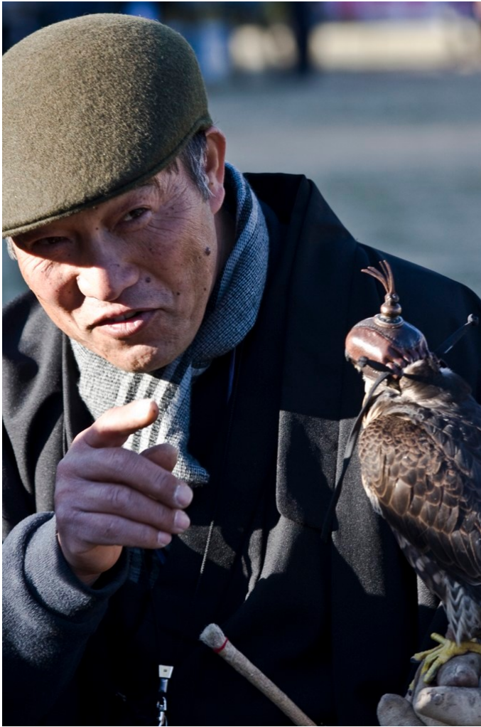
Unless I'm mistaken, this is an owl rather than a hawk.