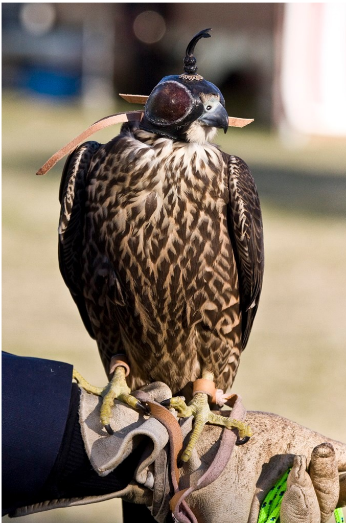
The birds wear these hoods to keep them from getting overstimulated and getting nervous.